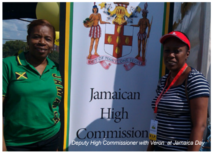
Jamaican High Commission Deputy High Commissioner with Veron at Jamaica Day