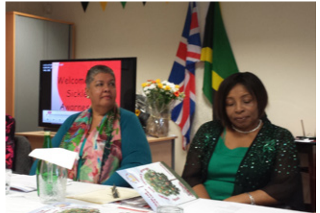
Wolverhampton Sickle Cell Care hosted a Patronage Ceremony in September for High Commissioner, H.E. Aloun Ndombet-Assamba