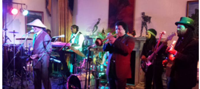
The Monty Band at fund raising Christmas Concert for Sir John Golding Centre