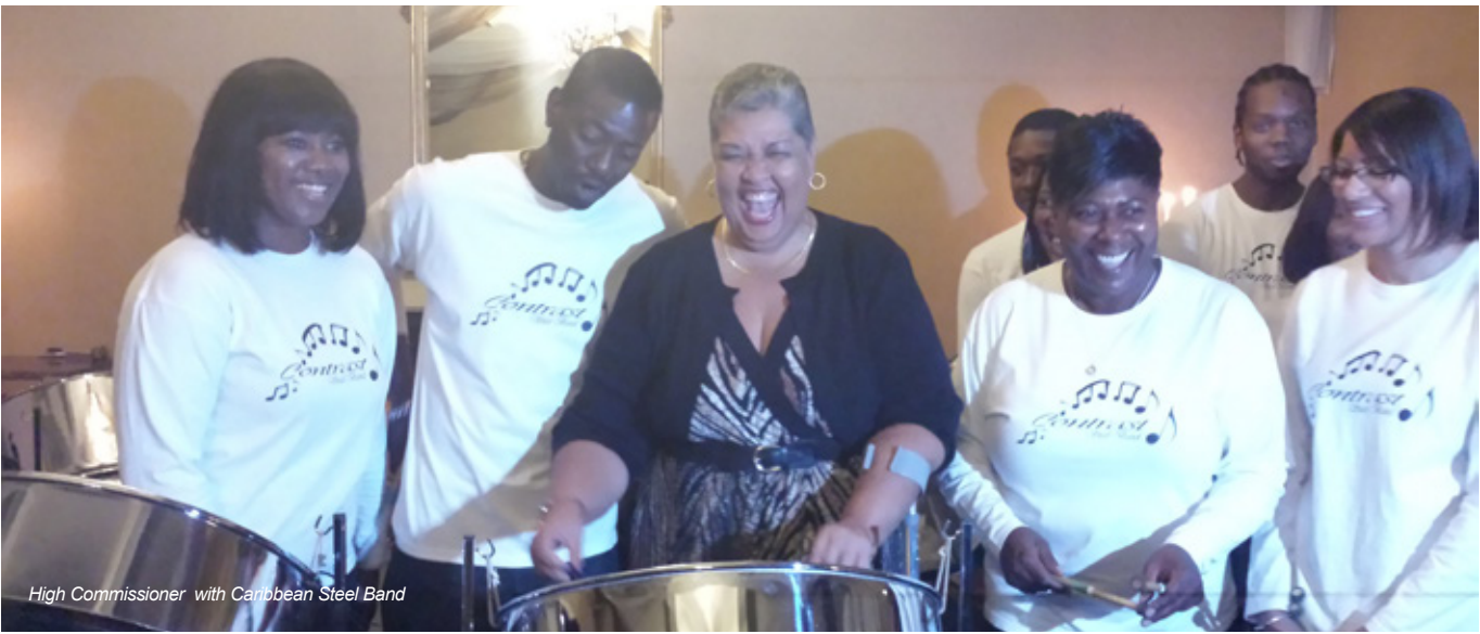
High Commissioner with Caribbean Steel Band