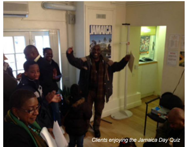
Clients enjoying the Jamaica Day Quiz