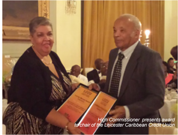
High Commissioner presents award to chair of the Leicester Caribbean Credit Union