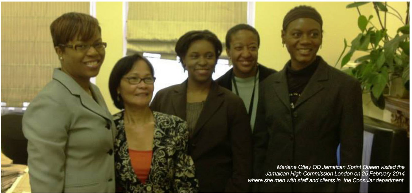
Merlene Ottey OD Jamaican Sprint Queen visited the Jamaican High Commission London on 25 February 2014 where she met with staff and clients in the Consular department.